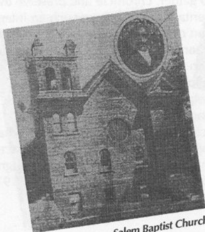
Salem Baptist Church

the 1870s, its members demonstrated their commitment to serve by using a rented facility until a new church was built on East Clark Street in Champaign.