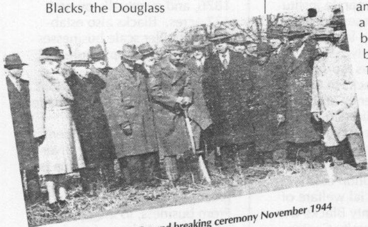
Ground breaking ceremony November 1944

the help of public funds and private donations, a new building was built in 1945. Since beginning in the 1930s, the Douglass Community Center has not only served as a place for recreational activities, but also as a structural reminder of Champaign-Urbana Black community unity.