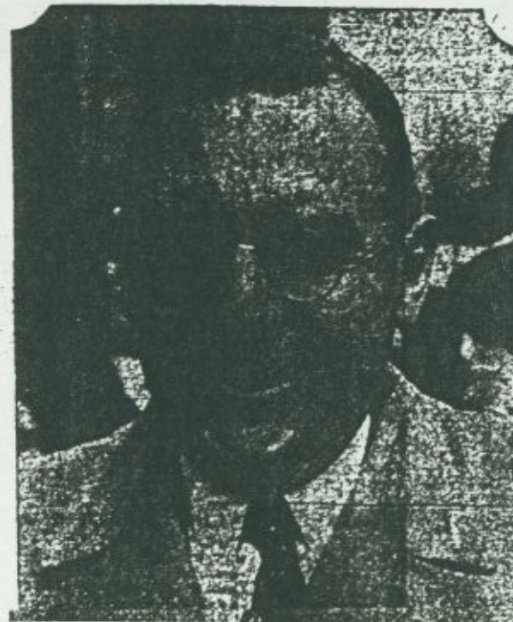
Life Ended by Assassin's Bullet